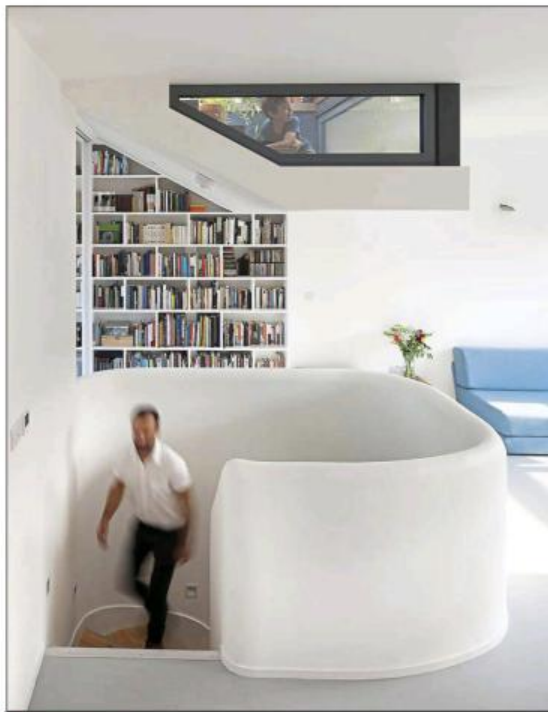
Simple elegance: white walls and bespoke shelving complete the light, sunny look

The couple's written ideas showed that the only thing they actually liked about their existing small flat was the garden, so for the new home, creating a private, secluded garden — in this case it could only be on the roof — was essential. Gaming technology and 3D modelling, resulting in 3D computer models with little figures, means you can see how everything works. Scenario now uses virtual reality, too, so you can "room around" inside your prospective home. The couple's new home has three full-