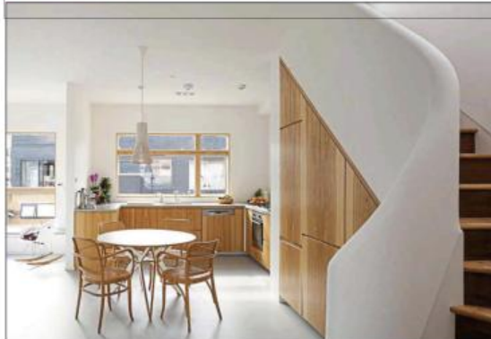
Style touches: the kitchen units and window seat have concrete tops, cast on site

size floors plus a large cedar-clad roof terrace. The ground floor is given over to a high-spec self-contained two-bedroom flat to let out. The upper two floors are the house proper, with three bedrooms and a bathroom on the lower floor, from which a wide, curvy, staircase sashays up to a vast, sunny living room with a corner kitchen. Over the sleek kitchen, steps rise to the decked roof terrace.